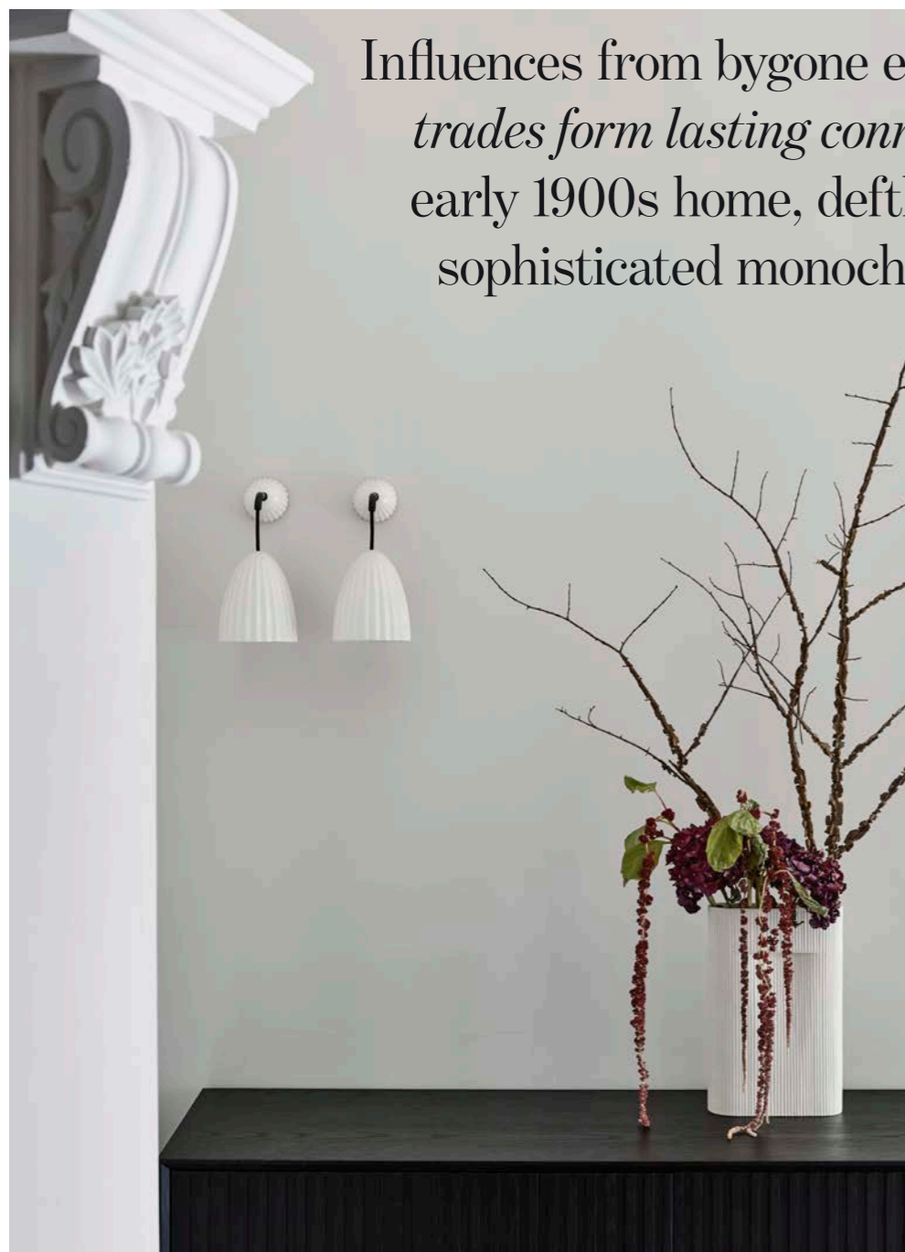
Words STEPHEN CRAFTI

Influences from bygone eras and forgotten trades form lasting connections in this early 1900s home, deftly unified via a sophisticated monochrome palette.