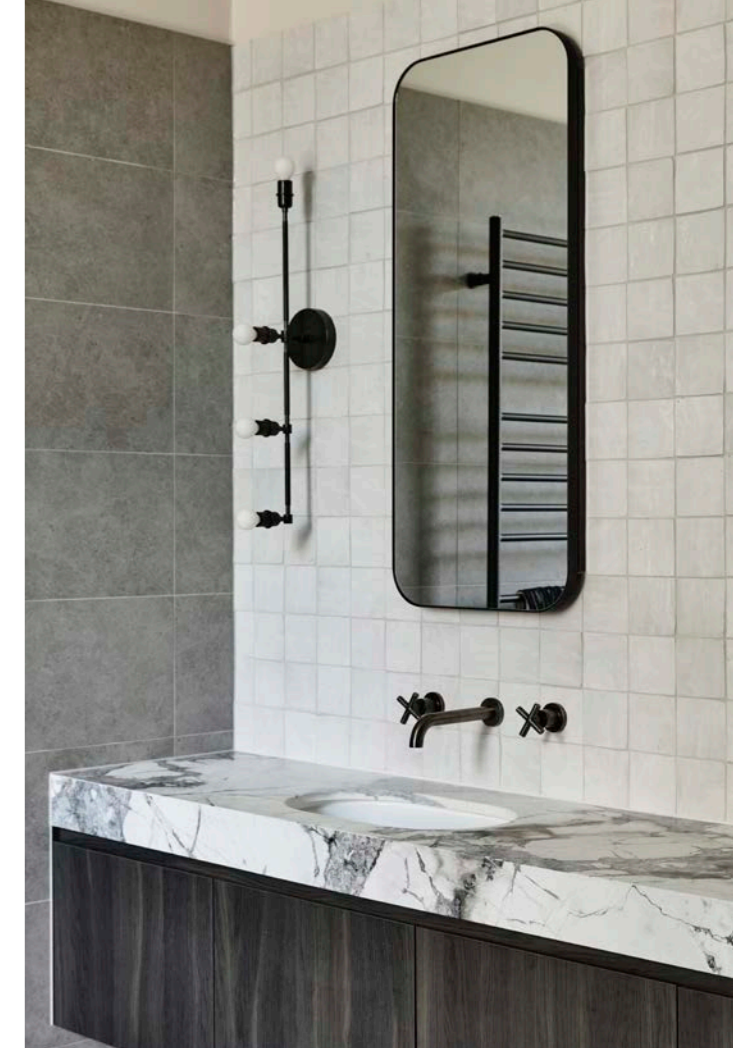
This page, clockwise from top left The bedroom suite is in keeping with contemporary living with Bedouin Societe bedding and throw cushion from Manon Bis. The main ensuite features Cote D'Azur marble on the vanity from CDK Stone. Apparatus sconce in brass from Criteria. The pavilion now leads to a large, north-facing timber deck furnished with a 'Paris' outdoor dining setting by Tom Fereday from Space. A simple palette of materials appears in the main ensuite such as the handmade Moroccan wall tiles from Tiles of Ezra. Opposite page In the master bedroom, Heatherly panelled padded headboard, shutters by Inside Edge Designer Window Furnishings and Egyptian rug in Starling from Armadillo & Co. Porcelain Bear 'Eido' pendant lights. Articolo 'Lumi' table lamp.