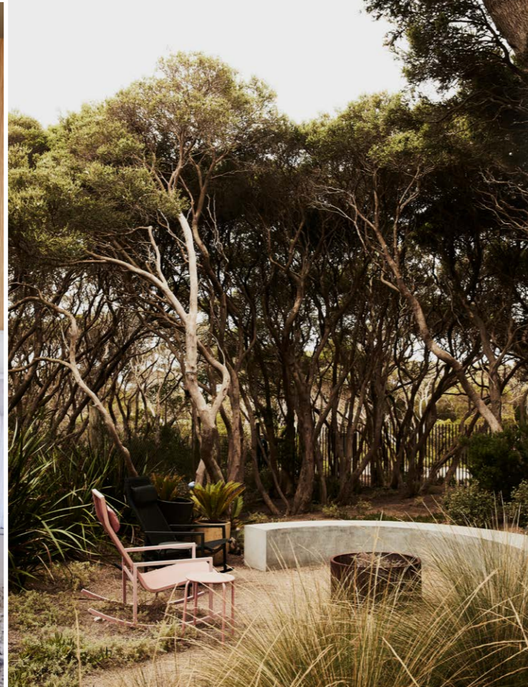
MAIN BEDROOM Pendant light, Beacon Lighting. Bedside table, Adairs. Australian House & Garden vase, bedlinen, cushions and throw, all Myer. Carpet, Floorspace. FRONT GARDEN Outdoor rockers, Domayne. Molly (Mel) drum firepit, Robert Plumb. Concrete bench, Hungry Wolf. POOL AREA Pool by Pop Building. Pool mosaics, The Pool Tile Company. Travertine coping by KHD Stone Merchants. Steppers, Hungry Wolf. Fence designed by Zenibaker Architects. POOL TERRACE Travertine pavers. Table and chairs, Remarkable Outdoor Living. For Where to Buy, see page 176.