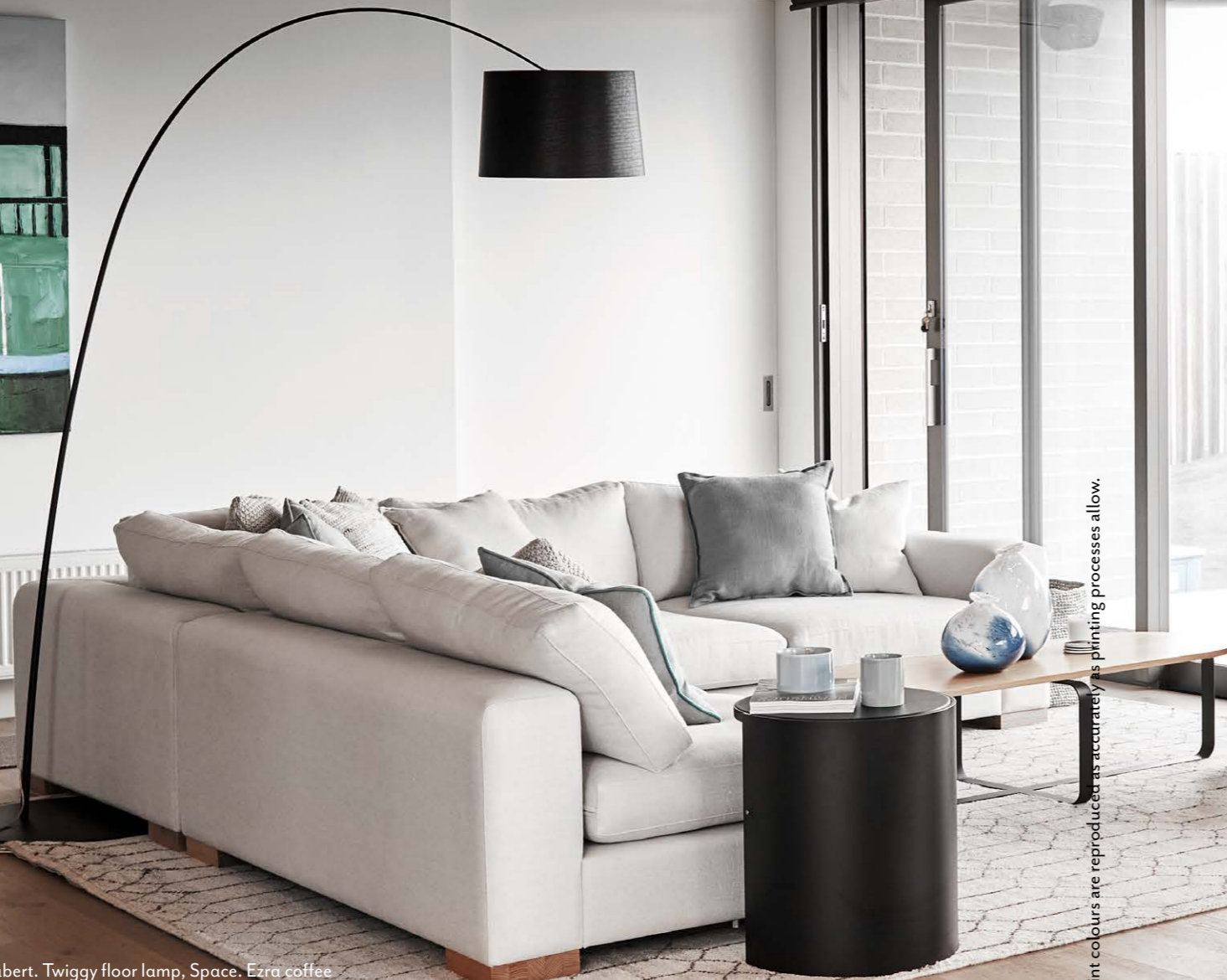
Paint colours are reproduced as accurately as printing processes allow.