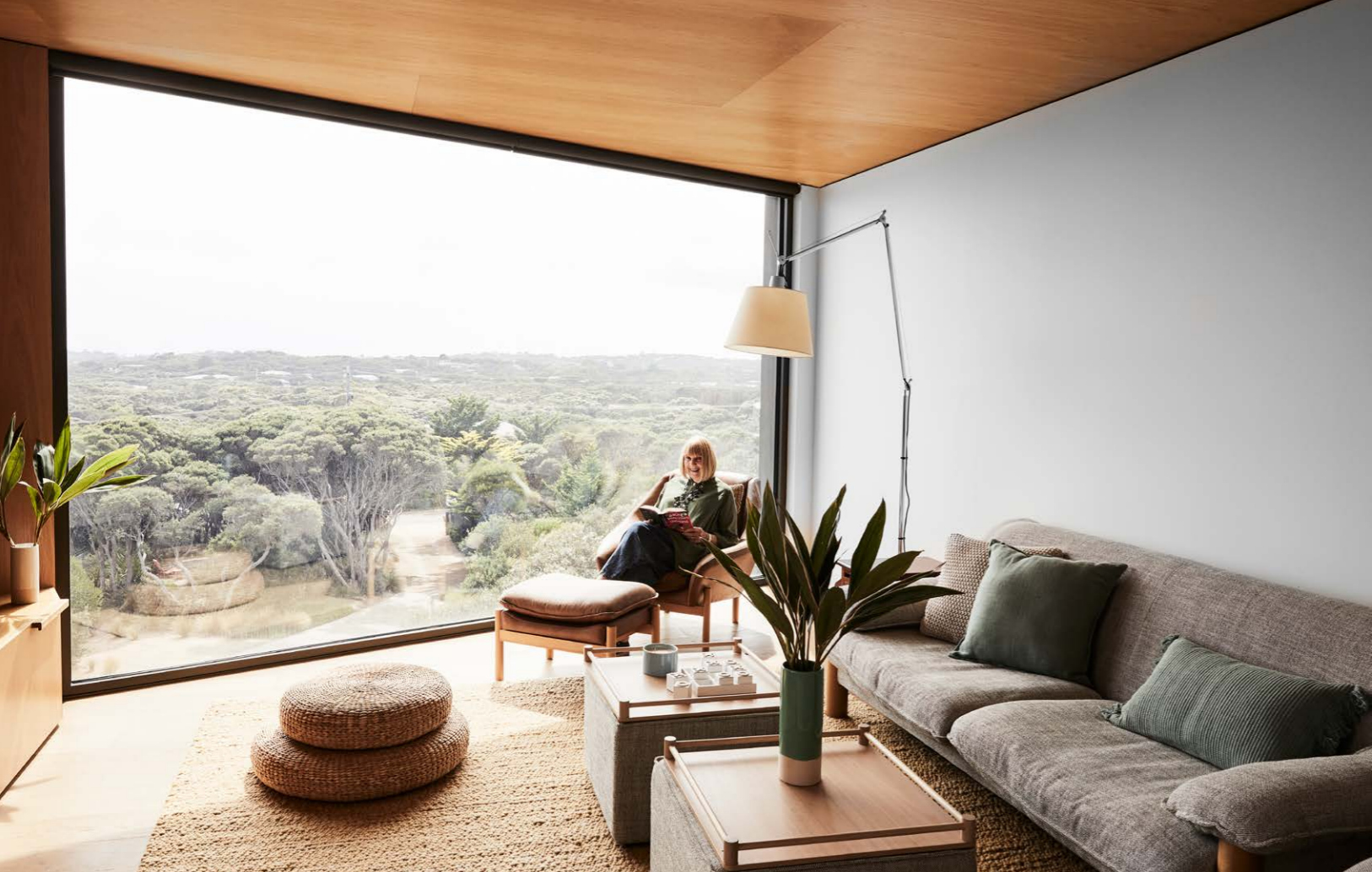
DINING Sculpture by Mela Cooke. Phasmida Branch 5 suspension light, Christopher Boots. Jade dining table, Zuster. Series 7 dining chairs, Cult. American-oak flooring, Royal Oak Floors (throughout). Ceiling clad in American-oak veneer (throughout). RETREAT Elaine enjoys a quiet moment. Double-glazed windows in low-e toughened glass by Autex Windows. The glass and window frame are rated BAL40 due to the risk of bushfire in the area. Tolomeo Mega floor lamp, Artemide. Leeroy sofa, Tommy ottomans and Nikki armchair with footstool, all Grazia & Co. Salsa rug, Halcyon Lake. Australian House & Garden vase and cushions, all Myer. FRONT GARDEN The curved path creates a palpable sense of arrival. Colorbond Windspray roof and downpipes. Landscaping designed by James Ross Landscape Design, maintained by J&K Plantscapes.